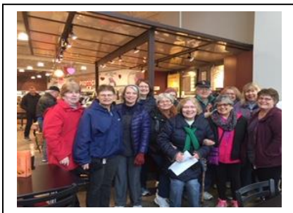
Walkers heading out on the O'Fallon YRE City Park trail on Saturday, February 2, 2019.