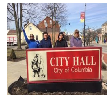
Beautiful day to walk in Columbia, IL on Tuesday, February 26, 2019.