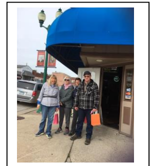
Walkers enjoying the Bunny Hop Traditional event in O'Fallon, IL on Saturday, April 13, 2019.