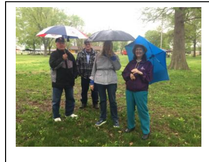
Even the rain didn't stop these walkers from kicking off the new Seasonal event in Mascoutah, IL on Saturday, April 27, 2019.