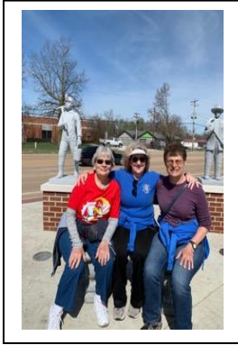
Walkers resting in front of the Veteran's Memorial on the Maryville YRE trail on Tuesday, April 9, 2019.