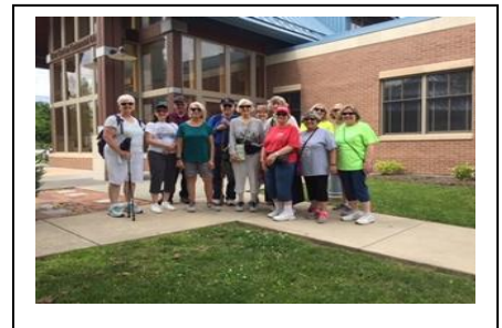
Group walk in Glen Carbon, IL on Saturday, May 25, 2019. What a great group of people.