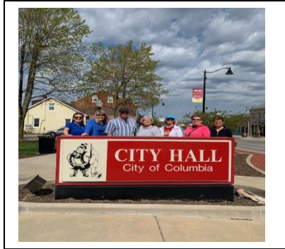
Walkers enjoying the day in Columbia, IL on Tuesday, April 16, 2019.