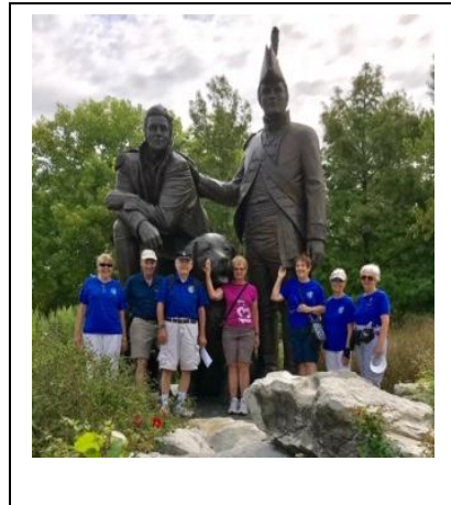
Walkers enjoying the St. Charles YRE on Wednesday, September 4.