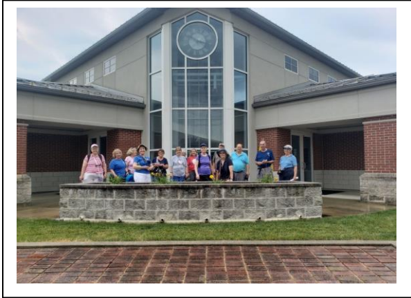
Walkers in front of City Hall in Nashville, IL during the Guided Group Event on Saturday, August 17.