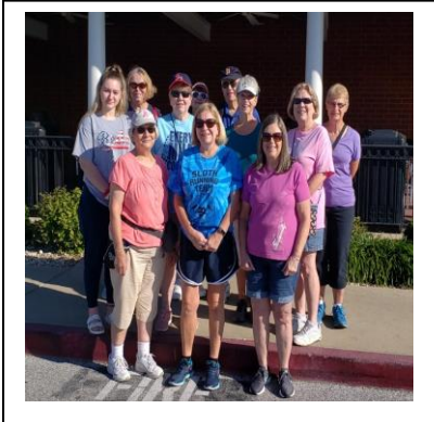
Group walk on Saturday, September 14 in O'Fallon, IL.