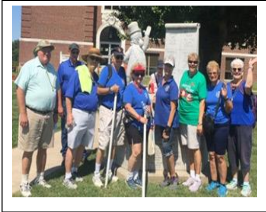
Illinois Trekkers at the Popeye Parade in Chester, IL.